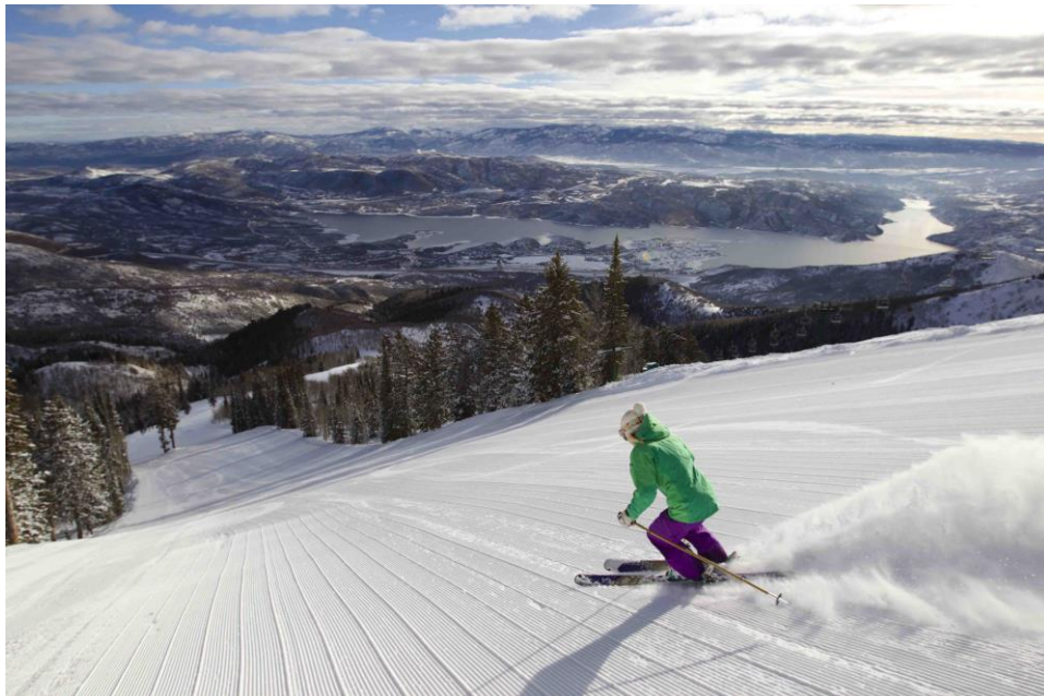
Deer Valley Mountain