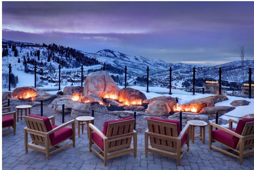
Après-Ski at Mountain Terrace, St. Regis Deer Valley